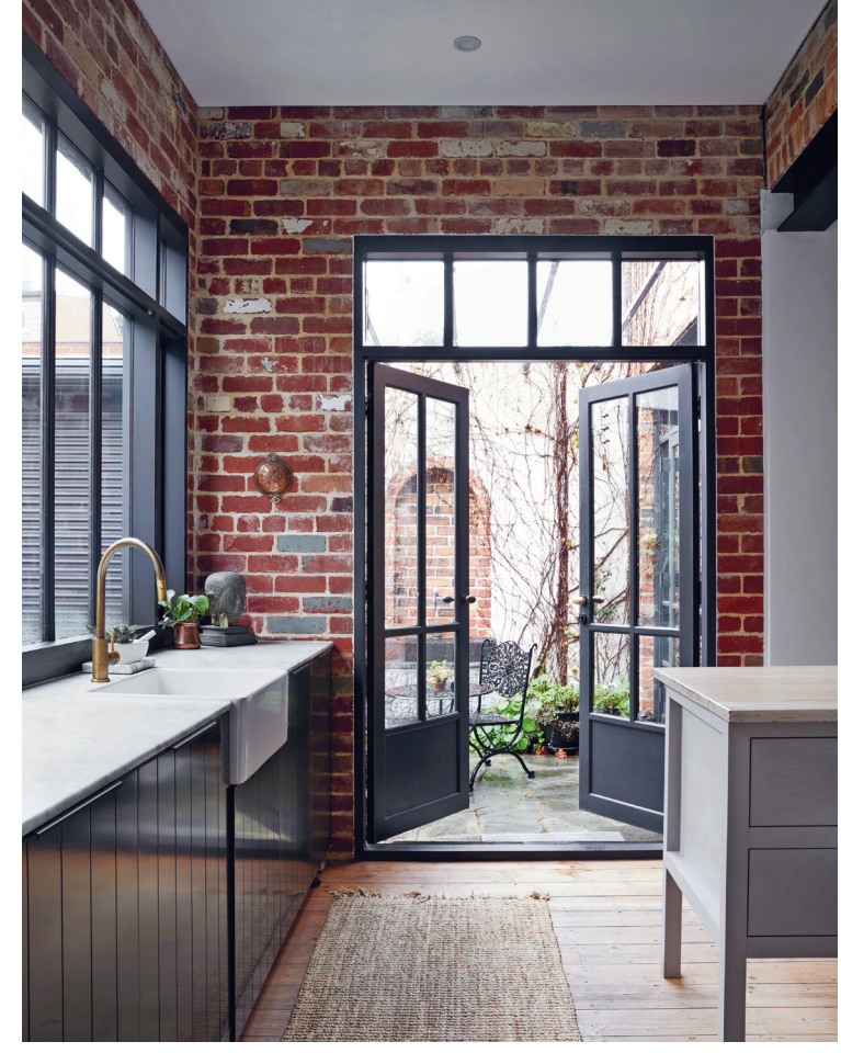
"The kitchen faces north so the windows and French doors capture beautiful light which did not exist at all in the original floorplan," says Giovannini.